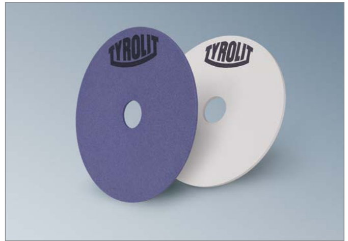
Conventional grinding tools

Specially adapted grain qualities and innovative bond systems combined with an efficient grinding wheel design optimise the quality of the cutting edge.