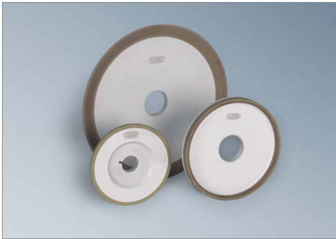
Diamond and CBN grinding tools

TYROLIT produces a comprehensive grinding tool range to grind saws and plastic machining tools. Apart from the conventional grinding wheels, it also comprises diamond and CBN grinding tools. In combination with the proven application engineering service, this enables TYROLIT to offer specific solutions that offer maximum benefit to the client.