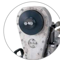
Gear swivel arm with quick-separation flange for easy blade replacement