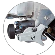
Sliding systems with ergonomic locking system and fine adjustment

The "work horse" among hydraulic wall saws. Use of the quick-separation flange on the swivel arm provides simple, fast blade replacement and facilitates use in